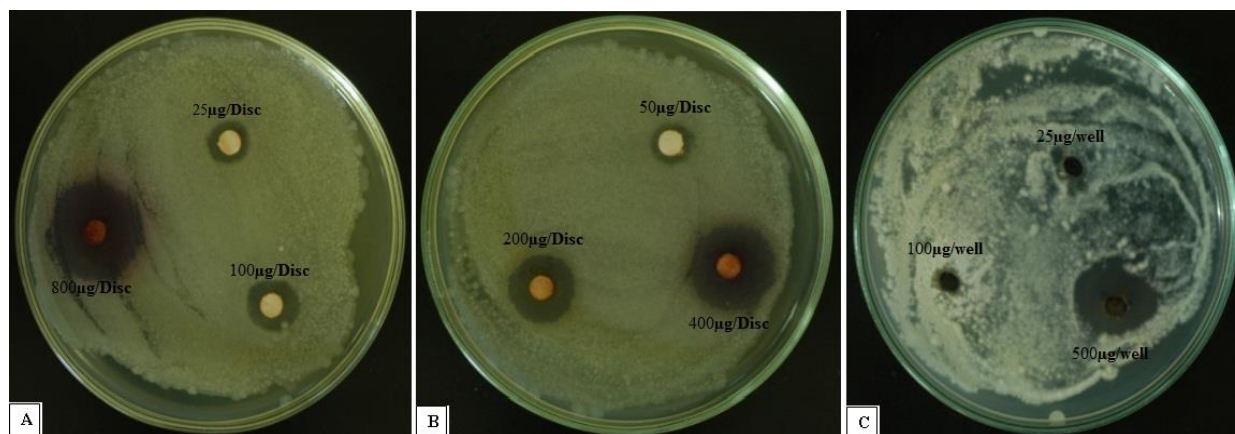
Fig. 2 – Antimicrobial activity of ethyl acetate extract of Nigrospora sp. A–B Antibacterial activity against E. coli , C Antifungal activity against Geotrichum sp.

10.66mm against C. albicans . The results showed that increase in concentration of extract increased the zone of inhibition. Among all selected four microorganisms, different size of zone of inhibition was exhibited at 25-100 µg/ml in increasing order 10-21.66mm against E. coli , 14-19mm against Klebsiella sp., and 10.66-20.33mm against C. albicans while against S. aureus similar zone of inhibition of 13mm was obtained at concentration 25-100 µg/ml and then increased up to 19.33mm at concentration of 800 µg/ml (Table 1). This antimicrobial activity by disc diffusion method was represented in Fig. 2.