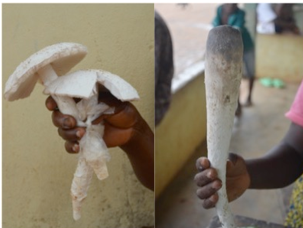
Fig. 2 – Mushrooms of Termitomyces collected from the northern communities in Cape Coast Metropolis.