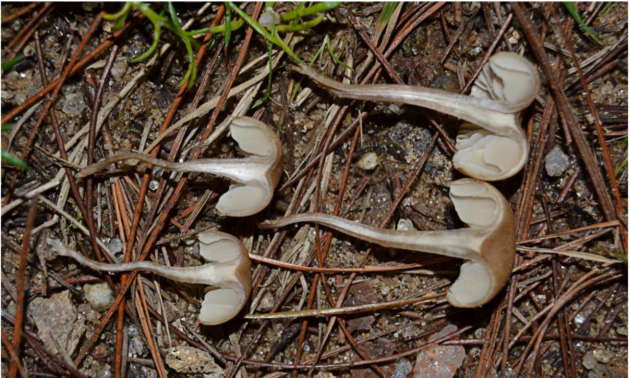
Fig. 2 – Longitudinal basidiomata sections of Fayodia gallaecicoloniana (LOU-Fungi 21051, holotype).