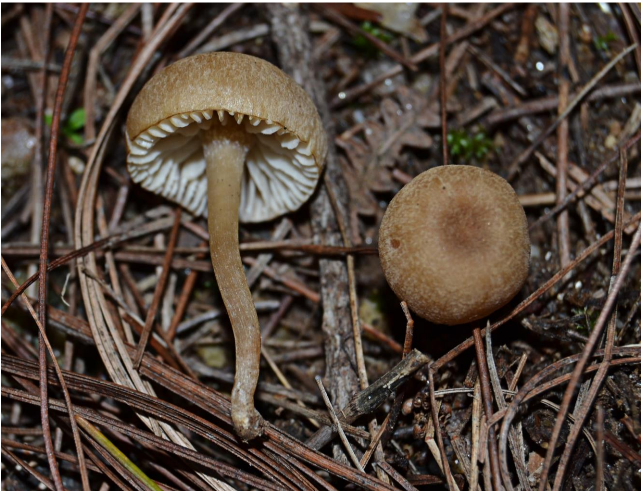
Fig. 1 – Basidiomata of Fayodia gallaecicoloniana in the field (LOU-Fungi 21051, holotype).

Material examined – Spain, Pontevedra: Pontevedra, Lourizán, 29TNG2795, 50 m, on Pinus patula needle litter, on granitic soil, 27 December 2015, J.B. Blanco-Dios (LOU-Fungi 21051, holotype).