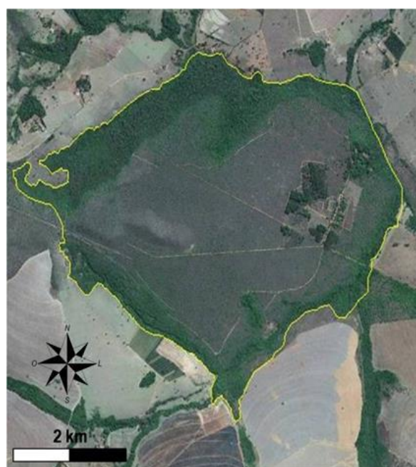
Fig. 2 – Demarcation (yellow line) of the FloNa of Silvânia, seen by satellite.