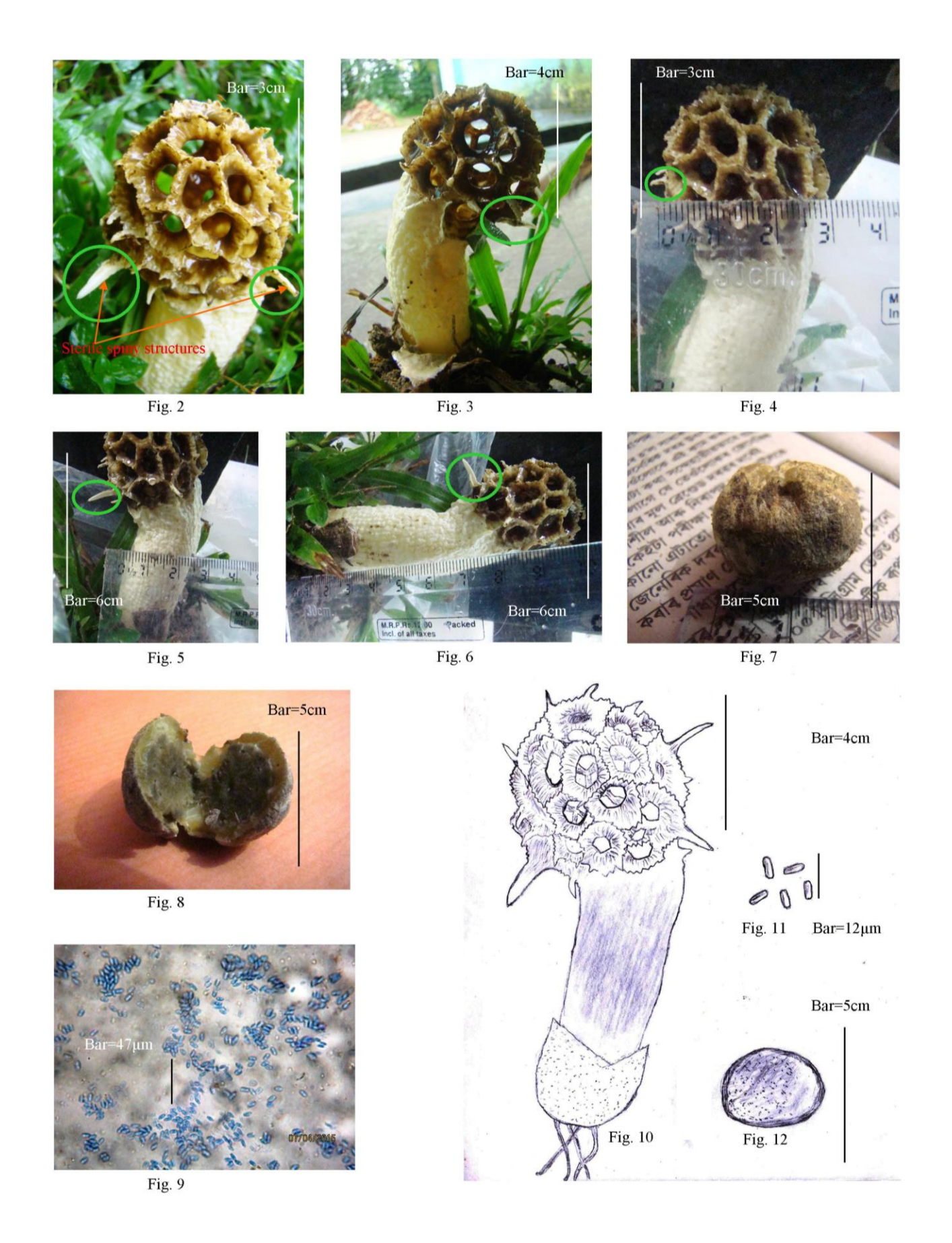
Figs 2–6 – Fruit bodies of Lysurus habungianus sp. nov. Figs 7–8 – Eggs, Fig. 9 – Basidiospores, Fig. 10 – Line diagram of Lysurus habungianus sp. nov. Fruit body, Fig. 11 – Line diagram of Basidiospores, Fig. 12 – Line diagram of an Egg